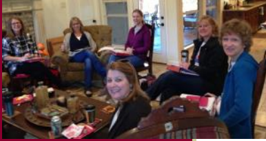
Board Meeting on January 18, 2014

Our board is a dedicated group of committed women who passionately believe in their mission of educating and training women so we can make a difference.